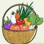
Food safety and nutritional health