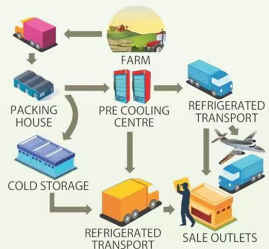
Food cold chain and quality control

This course takes advantage of the disciplinary strengths and international cooperation experience of SHOU. Through a four-dimensional linkage model of "theory - practice - industry - culture", it includes basic theory learning, practical skills learning, visits to experimental bases, visits to food enterprises, and activities to perceive Shanghai, etc. The aim of this course is to impart core knowledge focusing on the cutting-edge of food science and engineering to students from all over the world, enhance their ability to transform theories into industrial technologies, and expand their diverse understanding of regional characteristics and international cooperation in the food industry.