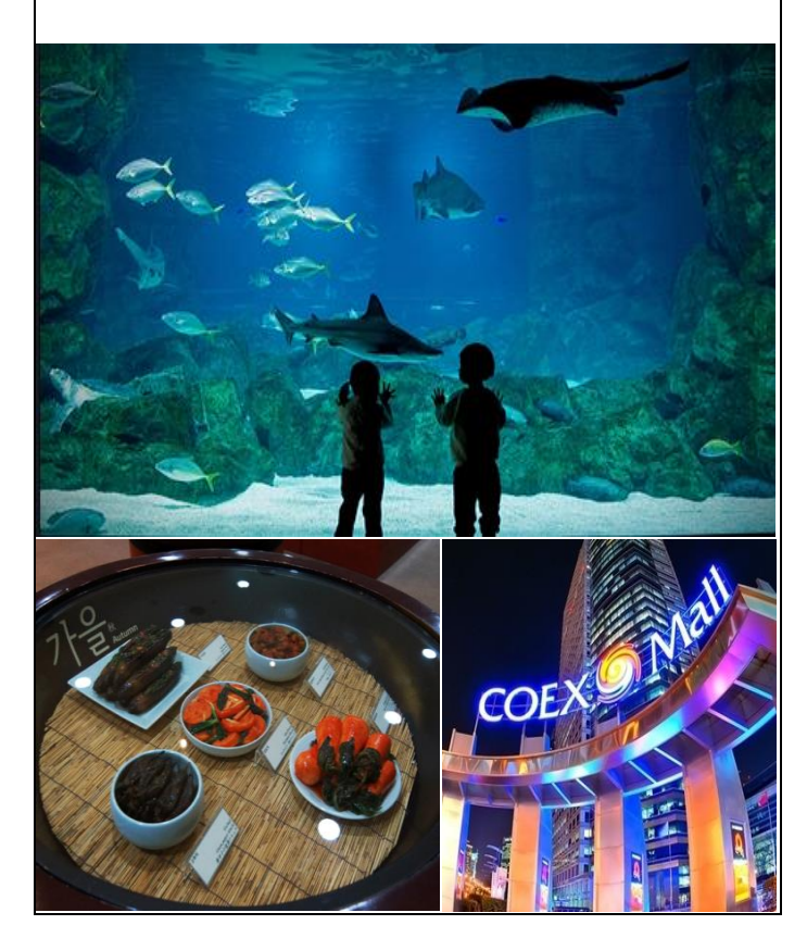
*Specific fee, schedule and activities may change without prior notice.

Coex is a business and cultural hub located in the heart of Gangnam, Seoul's business district. It is a popular entertainment destination in Seoul for both domestic and foreign visitors, and welcomes an average of 150,000 people on a daily basis. It is Asia's largest underground shopping complex adjacent to the Aquarium, a Kimchi Field Museum and the movie theatre. http://www.coex.co.kr/eng