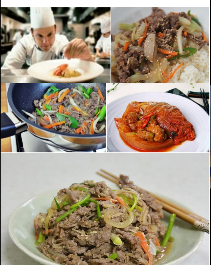
*Specific fee, schedule and activities may change without prior notice.

Bulgogi is one of Korea's most famous dish. It is marianated beef that is loved by many foreigners around the world. Students will have a chance to cook it by themselves in a professional cooking session and enjoy the food along with other international students and MJU students.