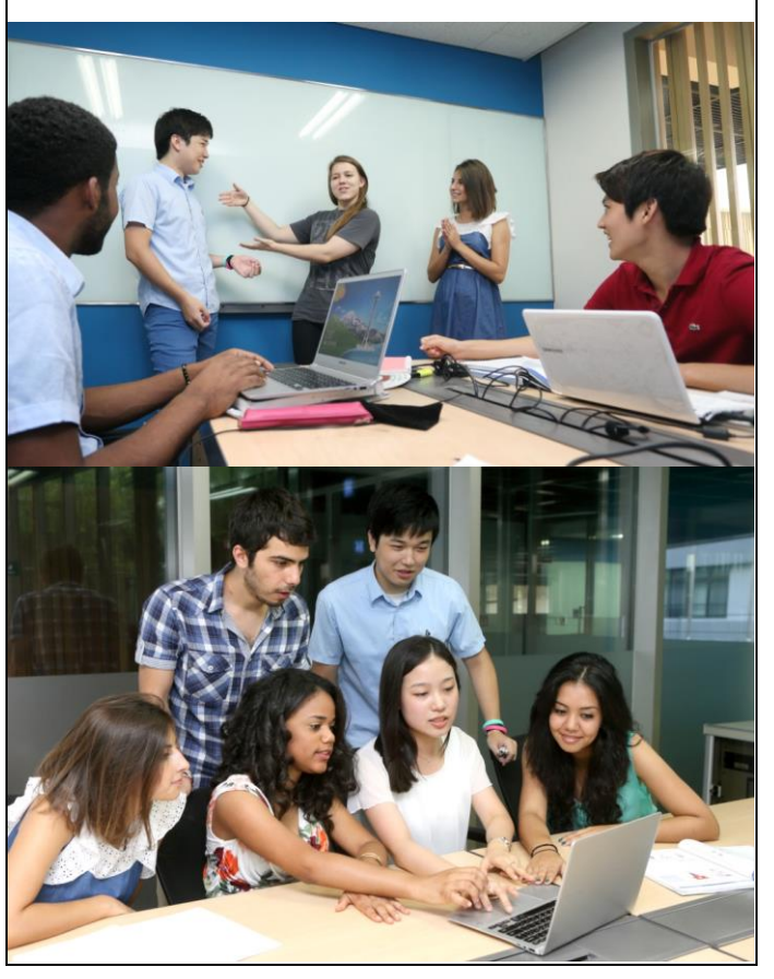
*Specific fee, schedule and activities may change without prior notice.

Students benefit from the Korean language courses offered at MJU nased on their individual needs, and the curriculum includes speaking (practice in converstaion), listening, reading and writing. Students will be placed in different level depending on their placement test results. Students are not required to know Korean. Curiosity is enough to learn.